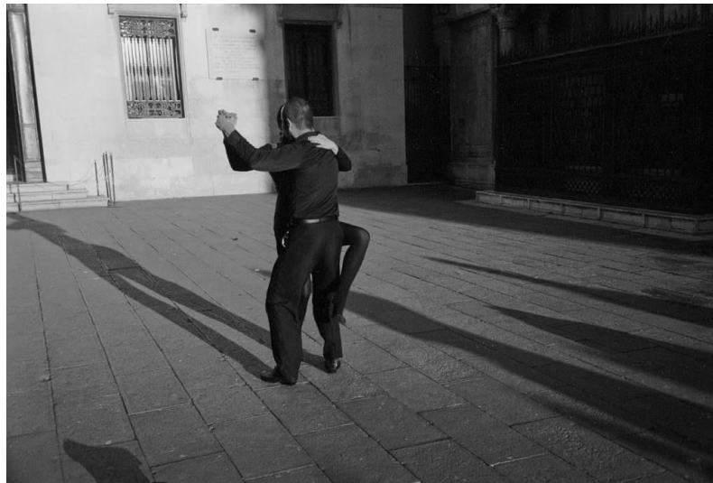
Bronze By Gold: Chapter Casanova