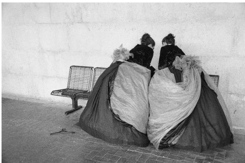
Bronze By Gold: Chapter Casanova

Alongside the cycle “Bronze by Gold” the exhibition will present a cycle that has been produced 30 years ago: Erinnerung an Aarenschoop . A photographed memory of childhood and youth. A book is available.