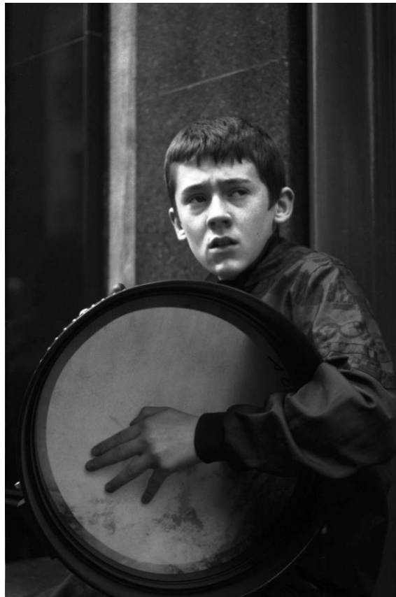
Bronze By Gold, Chapter: Joyce