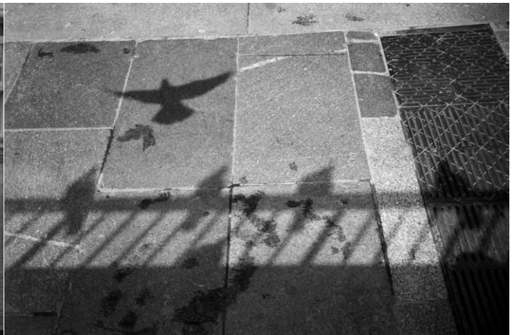
Bronze By Gold: Chapter Bulgakov