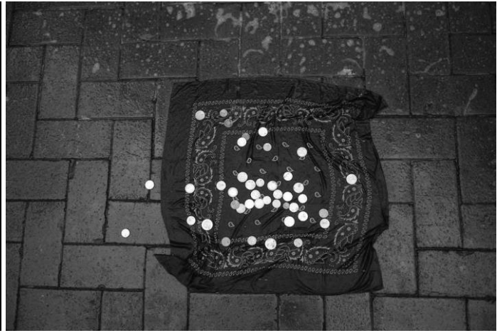
Bronze By Gold, Chapter: Joyce