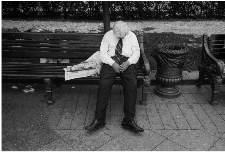
© Thomas Sandberg, Bronze By Gold: Chapter Bulgakov